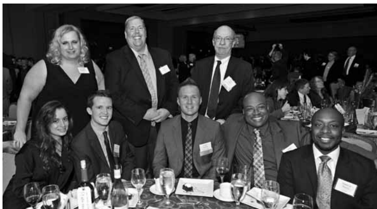
The State Street table.